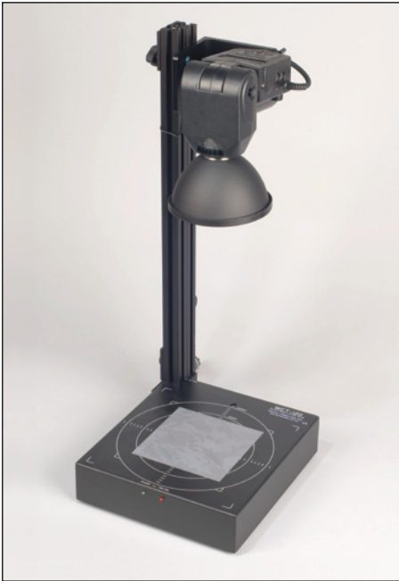
The WCT-120 is an affordable, tabletop silicon lifetime and wafer metrology system, suitable for both device research and industrial process control.

Best available calibrated measurement of carrier recombination lifetime. Widely used for both monocrystalline and multicrystalline silicon wafers.